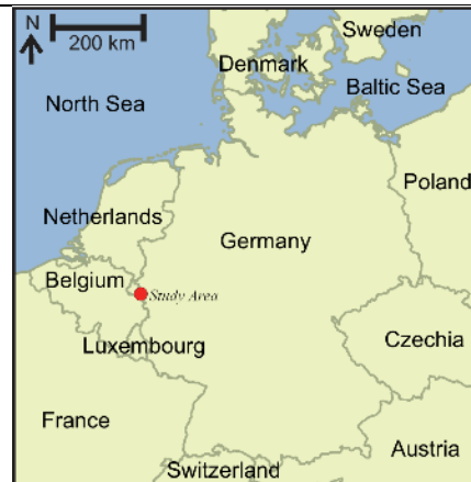
Fig. 1 Location of the study area near Aachen, Germany (modified from Bruckmann and Clauser, 2020)