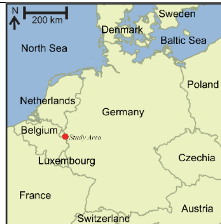
Fig. 1 Location of the study area near Aachen, Germany (modified from Bruckmann and Clauser, 2020)